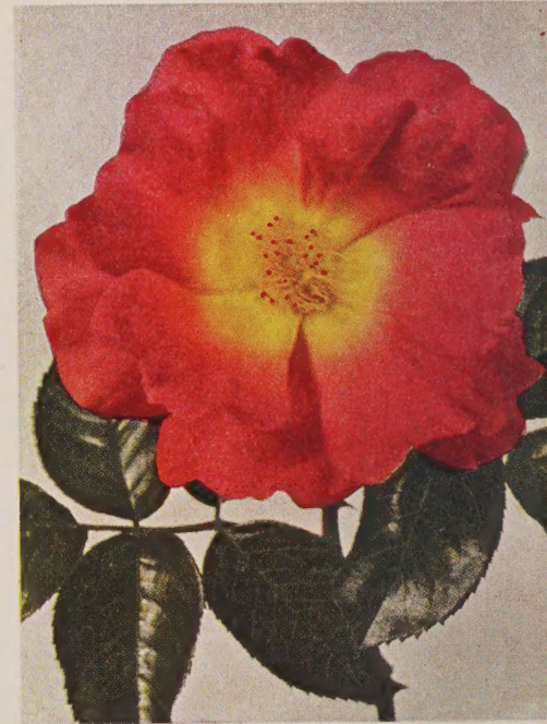
REVEIL DIJONNAIS (CLIMBER)

CL. TALISMAN. Everblooming flowers blending copper, red and deep yellow. Each $1.25